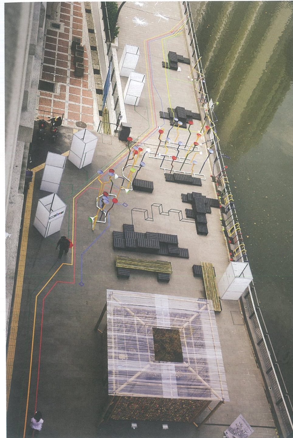
Overall view of pop-up structure beside Klang River

Urban Symphony, a fundamentally demonstrated versatile space that hold any kind of public activity. The installation allowed all kinds of interactions, and allowed visitors to participate in the exhibition and programs organized by UNHabitat for WUF9. It has also successfully offered pedestrians a new experience with its symphony and optical sensation, inverting and magnifying the urban landscape.