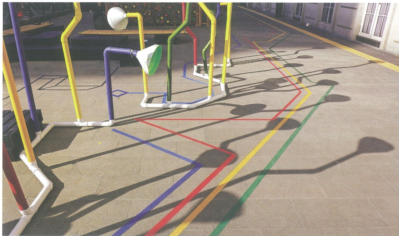
The Installation intended to create an awareness of quality public space